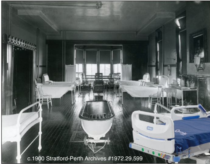
At SGH we've come a long way and so have our beds!